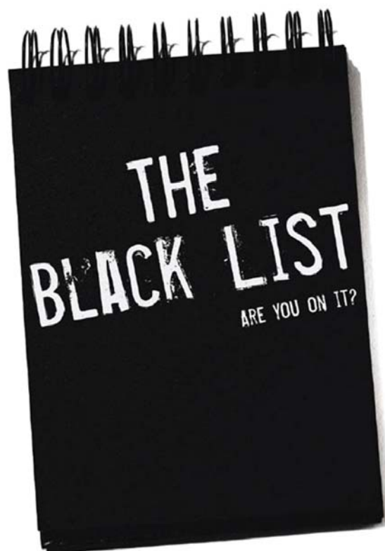
The film the Iranian gover

This is a UFFO registered Film Festival www.uffo.org